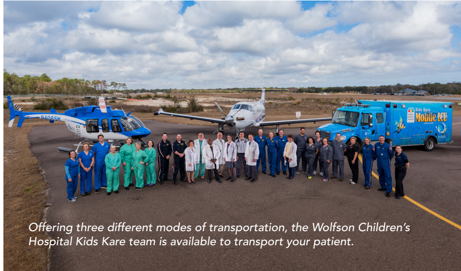
Offering three different modes of transportation, the Wolfson Children's Hospital Kids Kare team is available to transport your patient.

2. Transfer – Does your patient require transfer to a higher level facility? Call 904.202.KIDS and the Wolfson Children's Hospital Patient Care Logistics Center will coordinate all aspects of the transfer including acceptance, transport and bed placement for all levels of pediatric acuity ranging from trauma to general pediatric transfers.