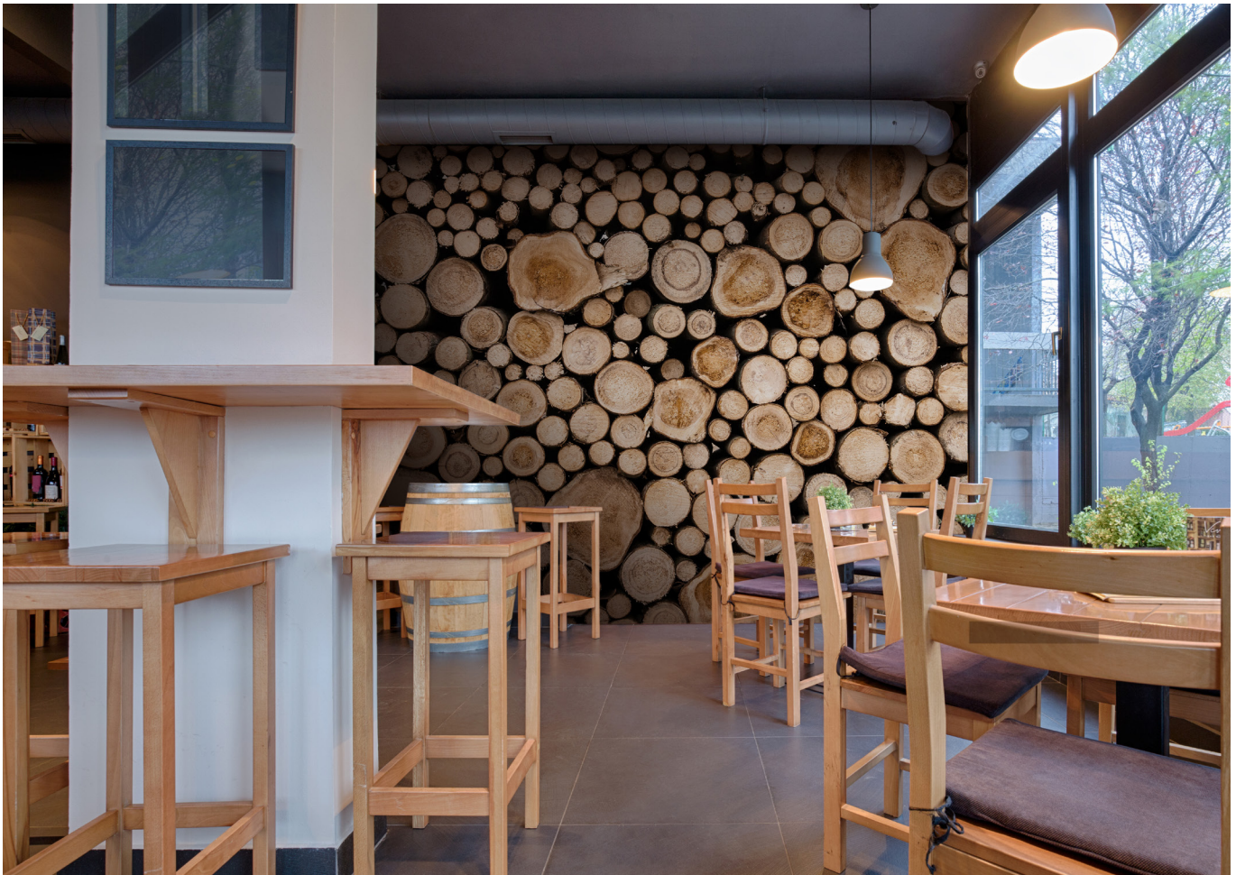
Top image: Zintra Acoustic 1/2" (12mm) Sheets custom cut in Slate, Cadet and Ochre Bottom image: Zintra Acoustic 1/2" (12mm) Sheet with Wood Digital Print