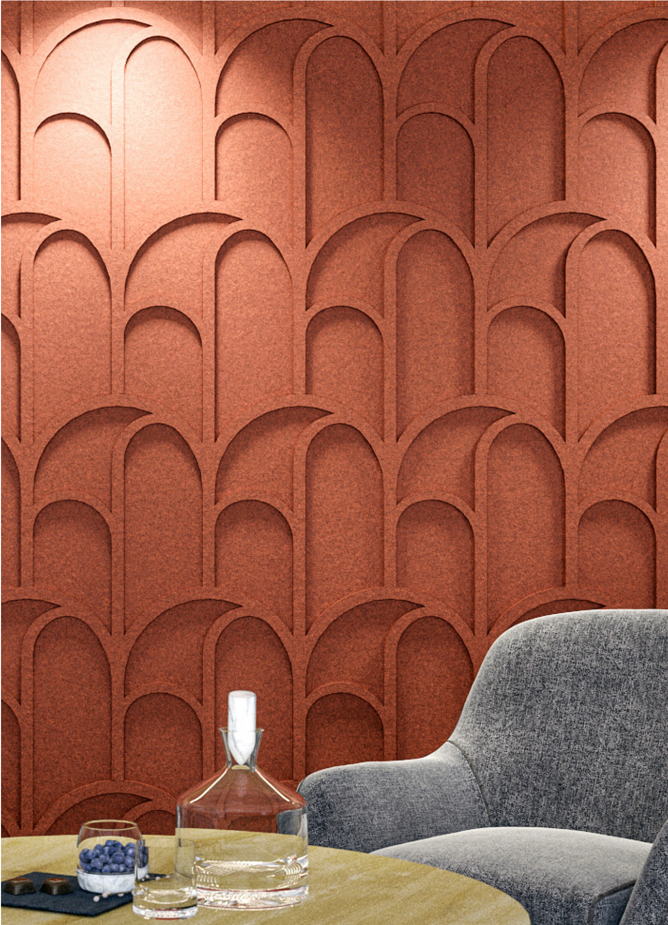
Zintra Pattern Tiles in Brick