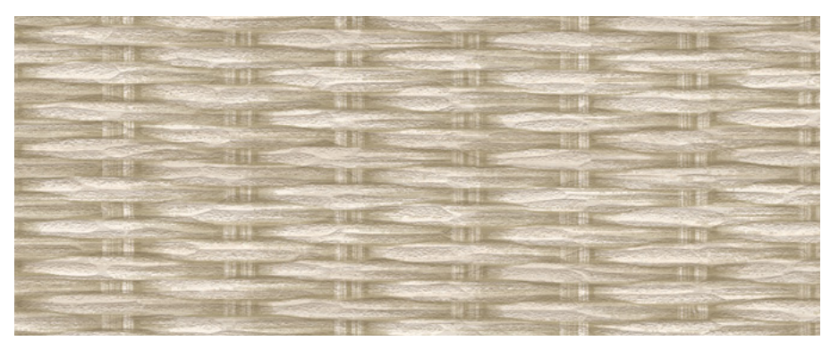
CANYON VIEW W2-WP-04