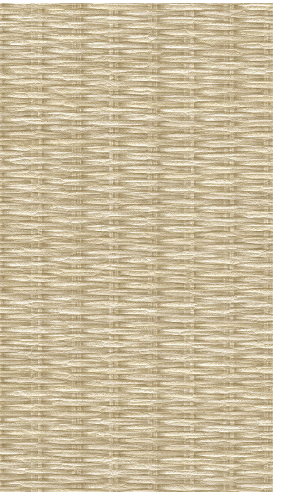
WHEAT FIELD W2-WP-01