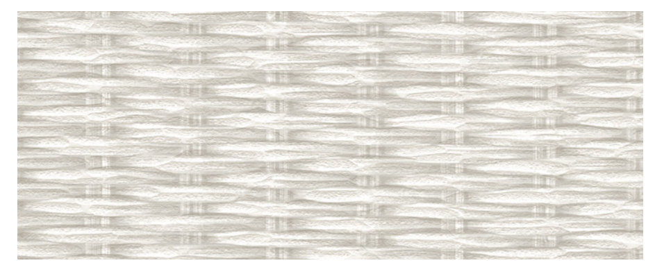
SILVER GRASS W2-WP-10