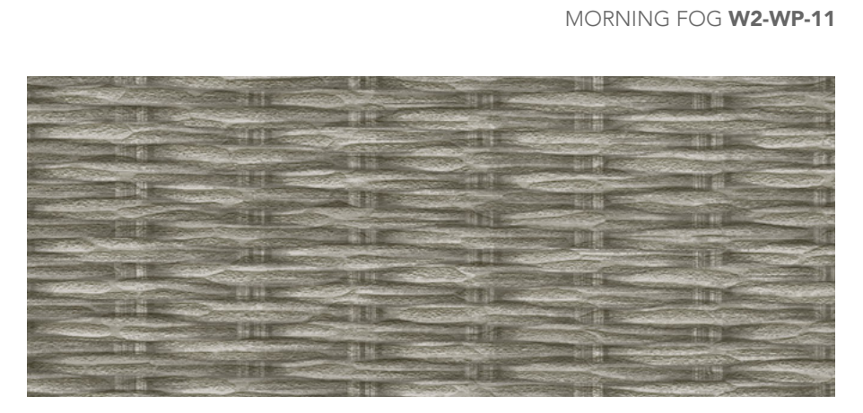
SLATE GREY W2-WP-12