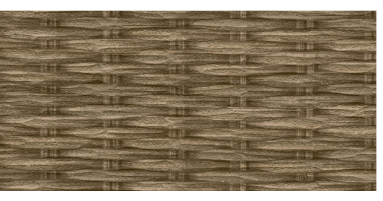
RAW UMBER W2-WP-09