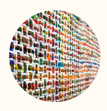
« Created by nature, crafted by hand.»