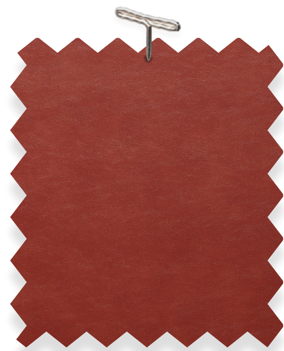
06 Autumn Harvest