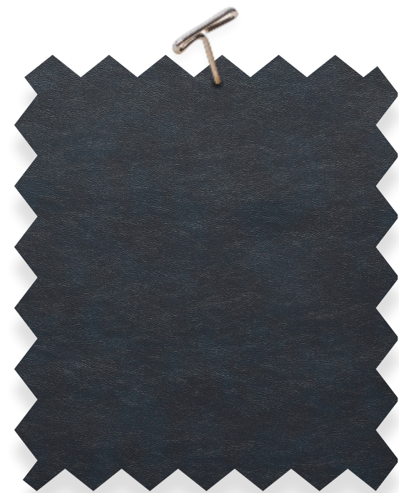
25 Deep Navy