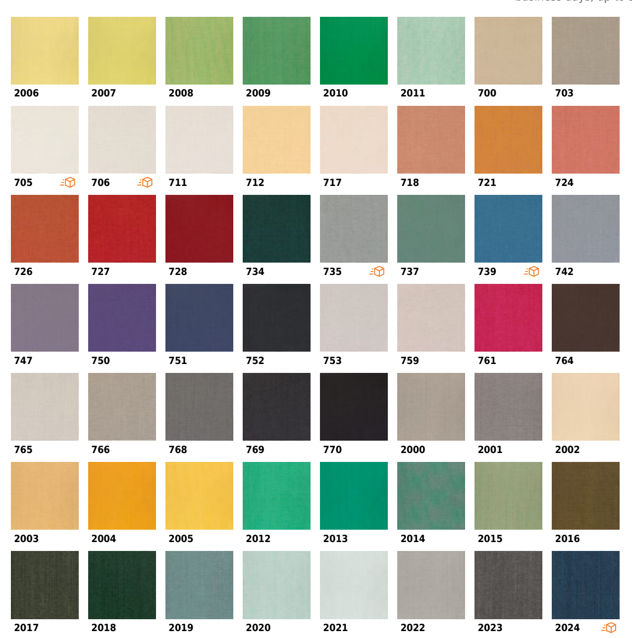
<u>→</u> Quick Ship Select colors ship from NY in 15 business days, up to 300 yards