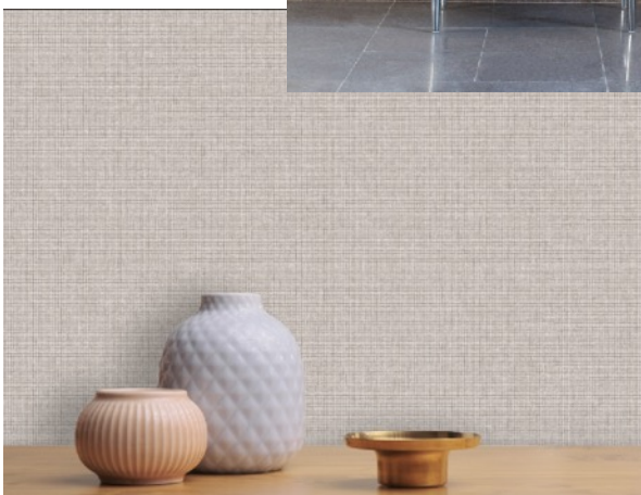
Somerset Weave: Pinstripe