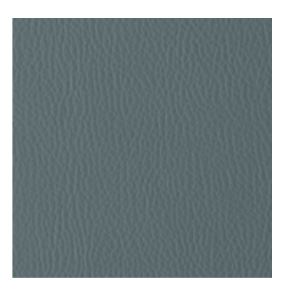
Nature 219 Seafoam