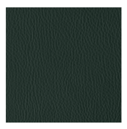
Nature 211 Spruce