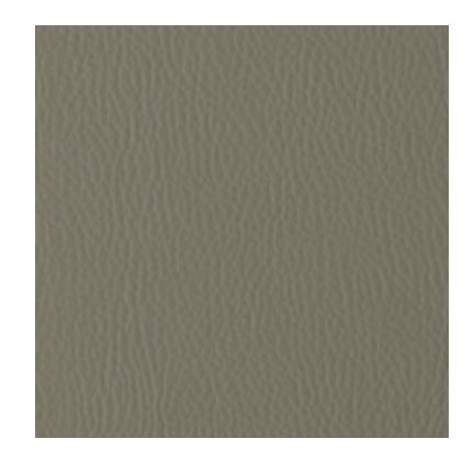
Nature LRV 33.5 823 Chablis