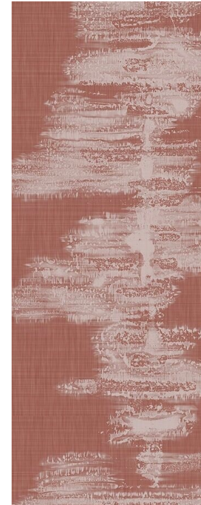
A217-558 / Henna