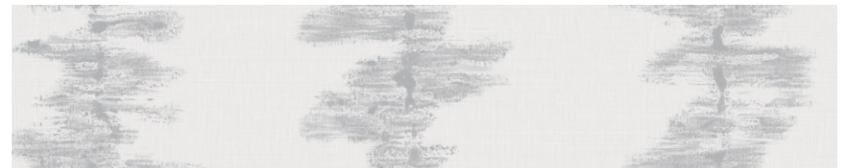
A217-844 / Whisper