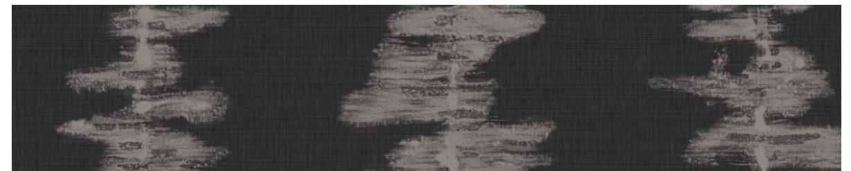
A217-820 / Puffin