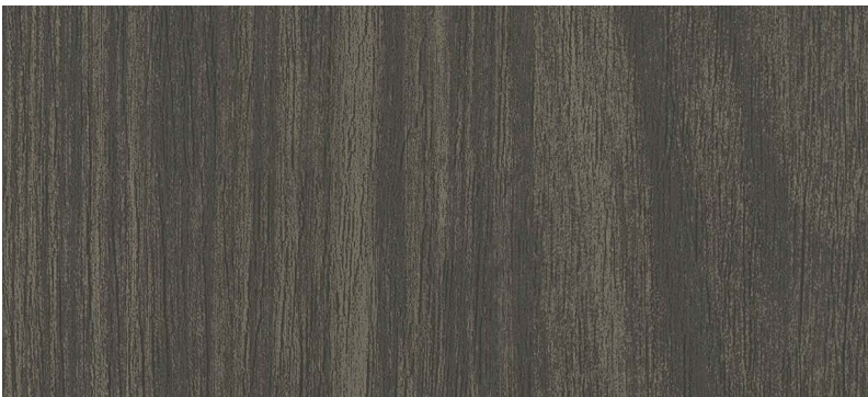
Exotic Black BB-WR-04