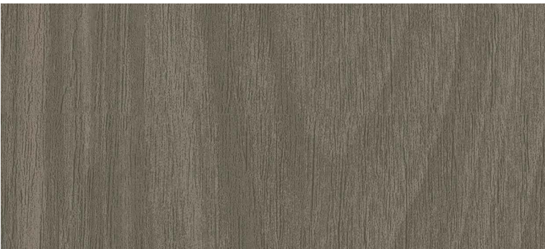
Antique Grey BB-WR-08