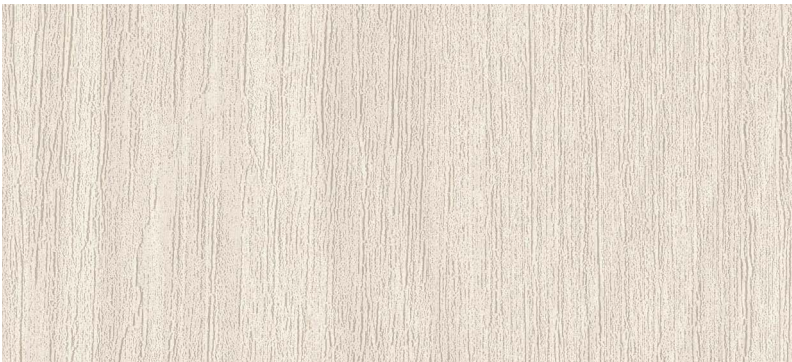
Pale Ash BB-WR-02