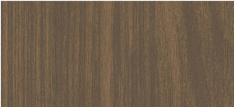
Special Walnut BB-WR-11