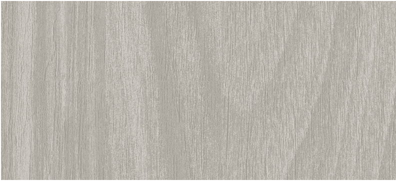
Chatswood Grey BB-WR-03