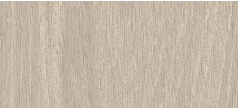
Gris Beige BB-WR-06