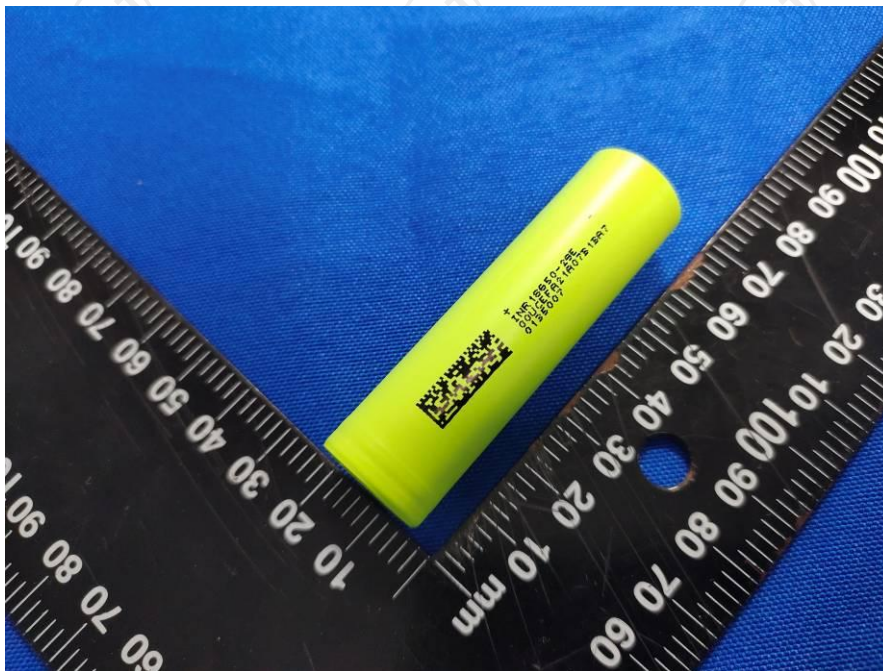
Picture 3. Cell view