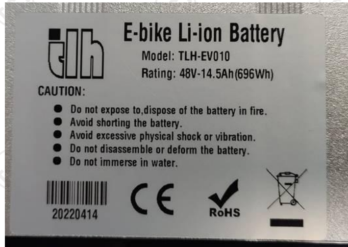
Picture 5. Label view