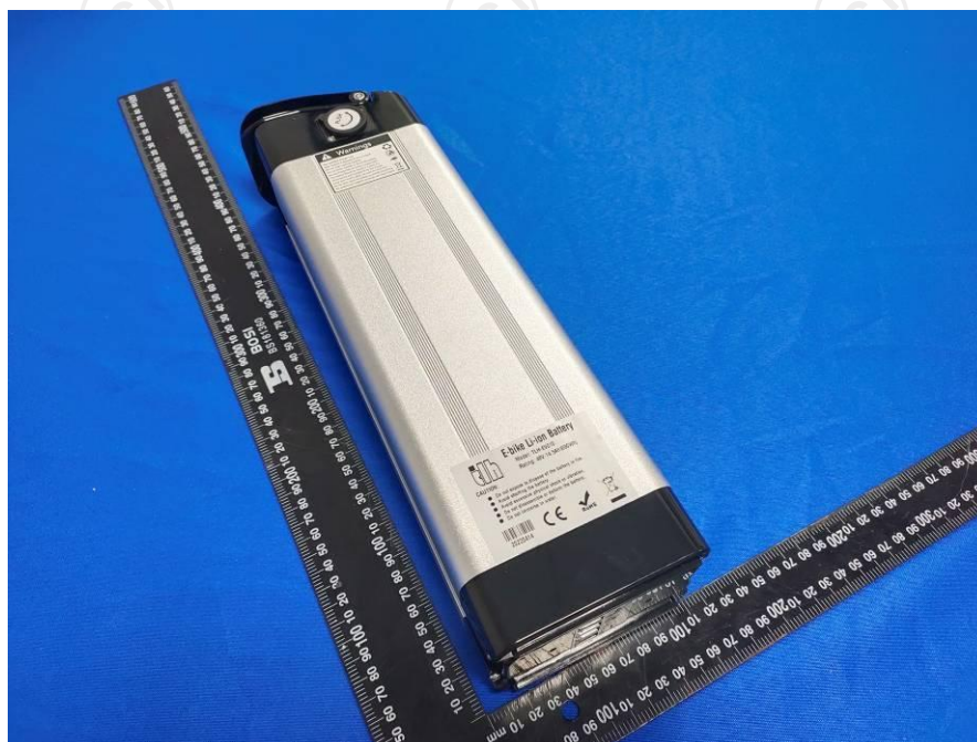
Picture 1. Battery view