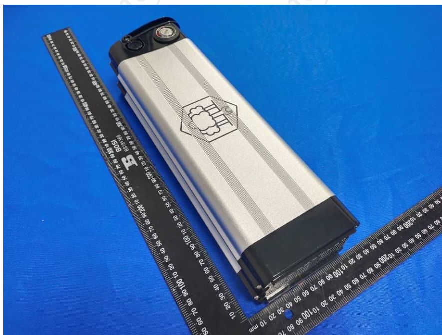
Picture 2. Battery view