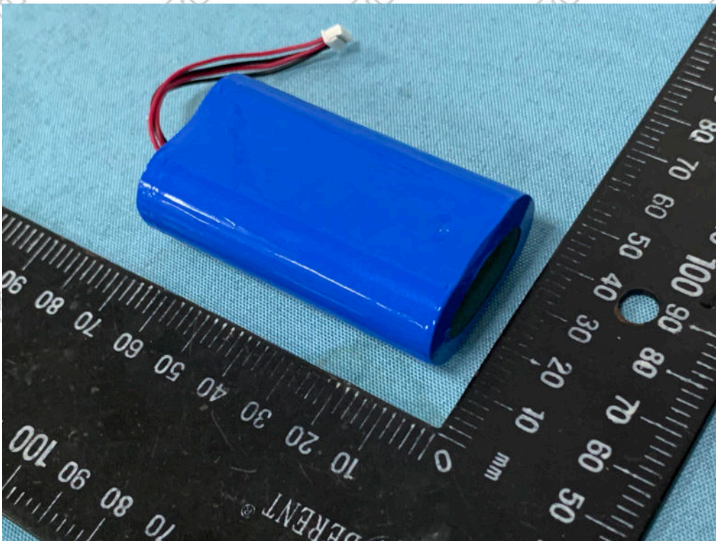
Figure 2 Overall view II of battery