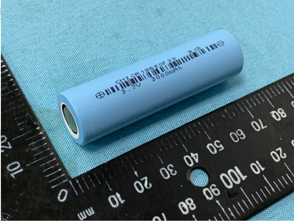
Figure 3 Overall view of cell