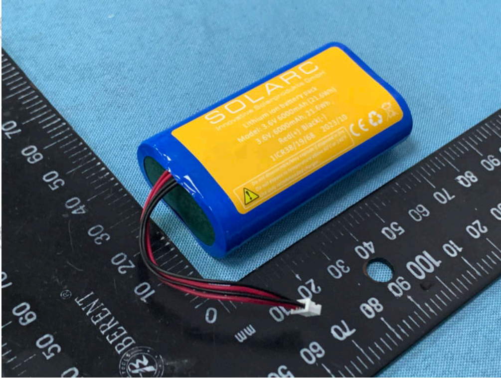
Figure 1 Overall view I of battery