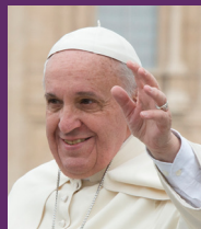
Photo from the Canonization of St. John XXIII and St. John Paul II in St. Peter’s Square on April 27, 2014

- Sunday Angelus given in St. Peter’s Square, July 17, 2016