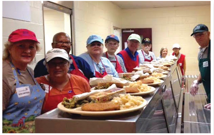
Feeding the Multitudes at Transitions! Bethels' faithful disciples!