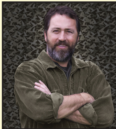
Duck Dynasty's Alan Robertson