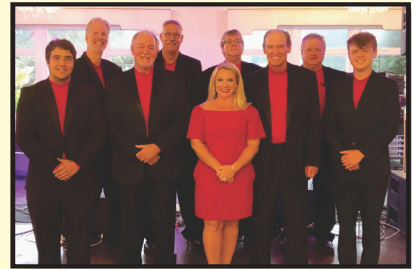
Mama's Home Cookin'