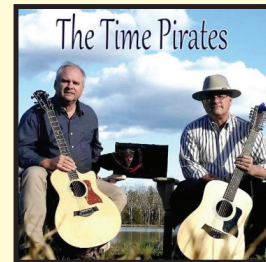
The Time Pirates