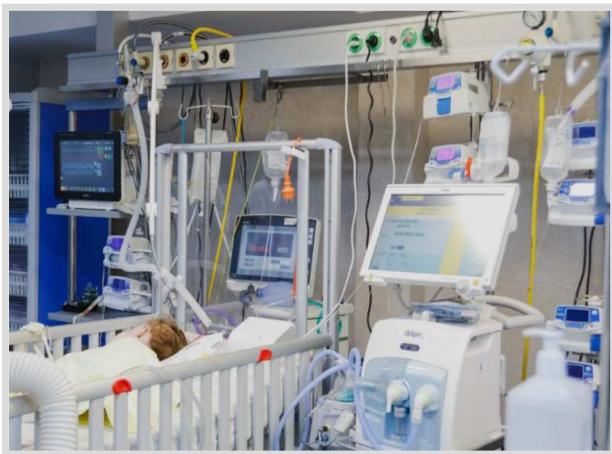
Donation to University Children's Clinic Tiršova

Donation of medical equipment to the Department of Cardiac Surgery of the University Children's Clinic Tiršova in May 2024 marked the official start of operations of Intesa Foundation. Tiršova was chosen for the first donation taking into account the foundation's field of activity and the importance that the Clinic has for the treatment of the youngest patients, not only in Serbia but also in the wider region, as well as its long-term cooperation