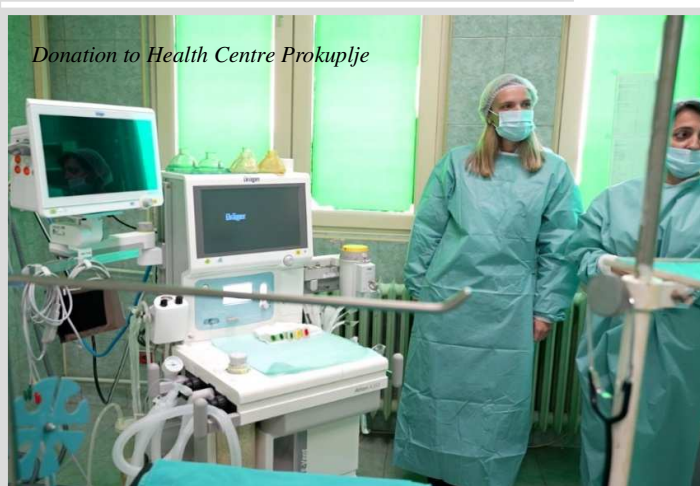
Donation to Health Centre Prokuplje