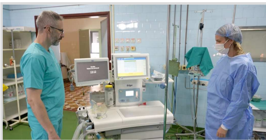
Donation to General Hospital Leskovac

The Health Centre Valjevo, covering the Kolubarski District with approximately 200,000 inhabitants and 8,000 surgeries performed per year, was a beneficiary of a medical equipment donation in the total value of RSD 9,515,520. The donation aimed to improve the existing equipment in the Cabinet for Endocrine Surgery and the intensive care unit of the Anesthesia Service and included an anesthesia machine, two patient monitors, a surgical aspirator and an ultrasound.