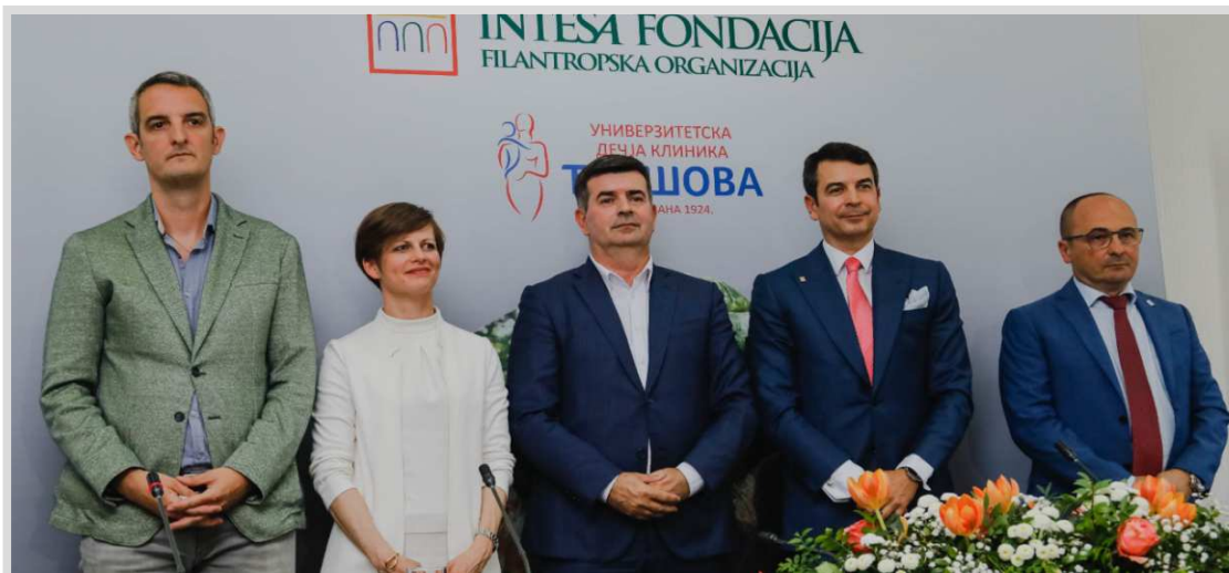
Donation to University Children's Clinic Tiršova

with Banca Intesa Beograd. This donation was a continuation of Banca Intesa activities aimed at improving conditions for the University Children's Clinic, which commenced in 2011 when RSD 25 million were allocated for the reconstruction of its Department of Cardiology and Cardiac Surgery.