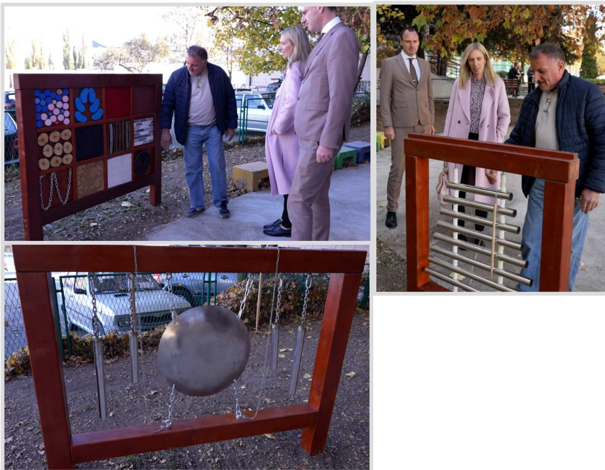
Donation to "Vidovdan" school in Bor

The "Vidovdan" school for primary and secondary education of children with developmental disabilities in Bor, attended by about 70 pupils, is the beneficiary of a donation that equipped a sensory garden in the school yard, with the aim of stimulating balance, sense of space, orientation and free movement. The total amount of the donation was RSD 582,000 dinars and it provided xylophone percussion instruments, percussion instruments with round pipes, percussion instruments with pipes and bongs, a sensory board, and a sensory garden.