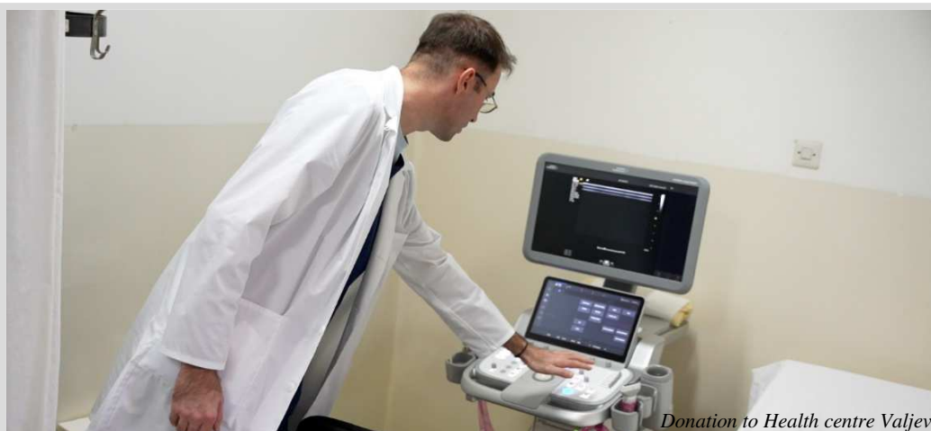
Donation to Health centre Valjevo

The Health Centre Prokuplje, serving around 30,000 patients and performing over 7,500 surgeries annually in the Toplica District, received a medical equipment donation worth RSD 9,159,691. The donation included an anesthesia machine and a medical vehicle for patient transport.