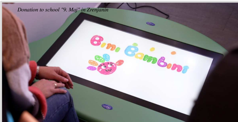
Donation to school "9. Maj" in Zrenjanin

The VoiceToys platform, designed to stimulate psychophysical functions of children, was donated to the "Sveti Sava" in Umka, school for primary and secondary education of children with developmental disabilities that is attended by around 160 pupils. The donation worth RSD 399,535 comprised a Vibe Y-vibrotactile box, Spread Y – 5 luminous columns, a Space Y-system of 5 loudspeakers, and Yump Y – a luminous panel with distance sensor.