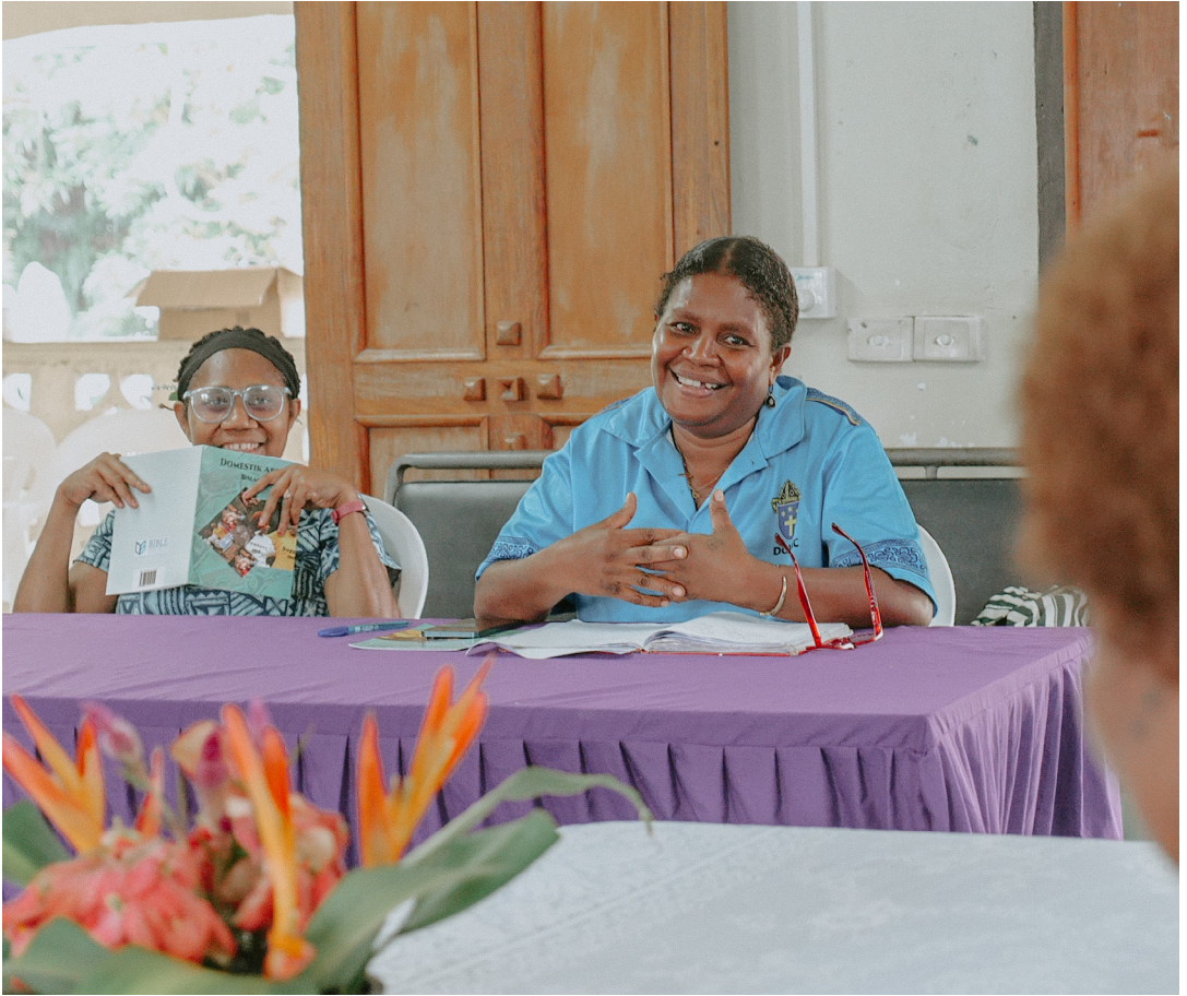
Trauma healing facilitators at a training workshop in Vanuatu.

people opening their hearts. Eventually, she hopes there will be safe houses, counselling spaces and practical support systems that do not yet exist in Vanuatu.