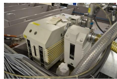
All pictures are just for Information and do not express the scope of sale!