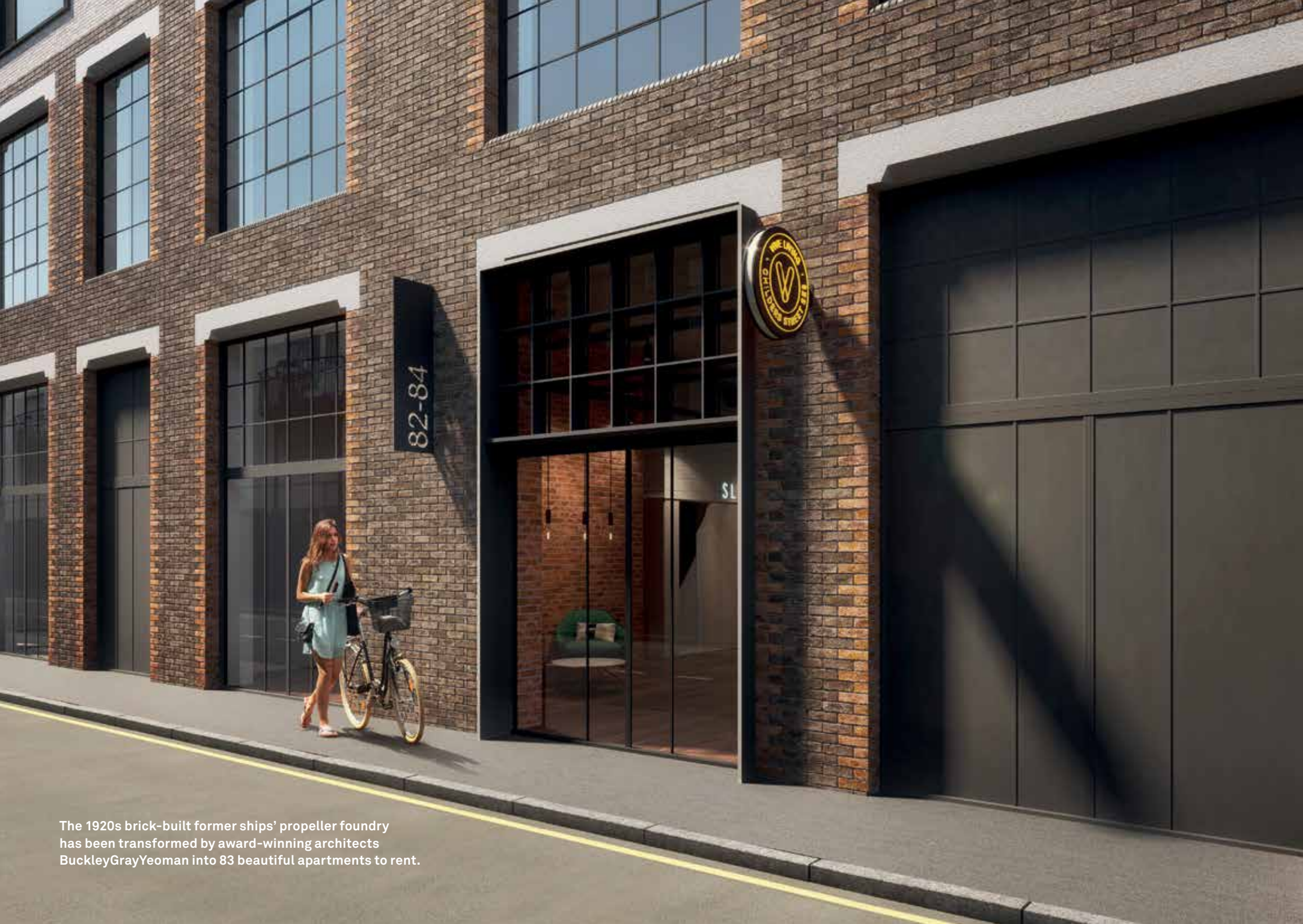
The 1920s brick-built former ships' propeller foundry has been transformed by award-winning architects BuckleyGrayYeoman into 83 beautiful apartments to rent.