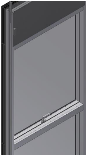
01. Vent locked