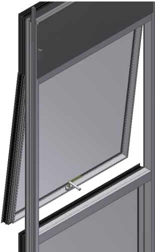
06. When closing vent will lock @ 100mm position