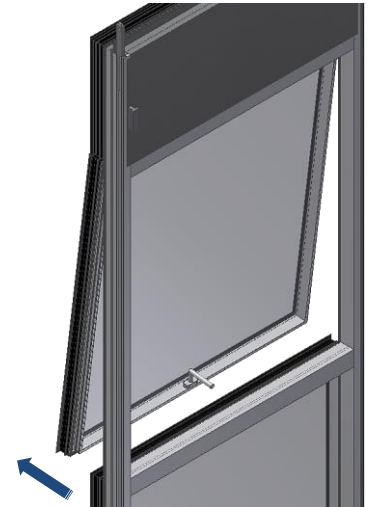
03. Open vent Vent will lock in 100mm position