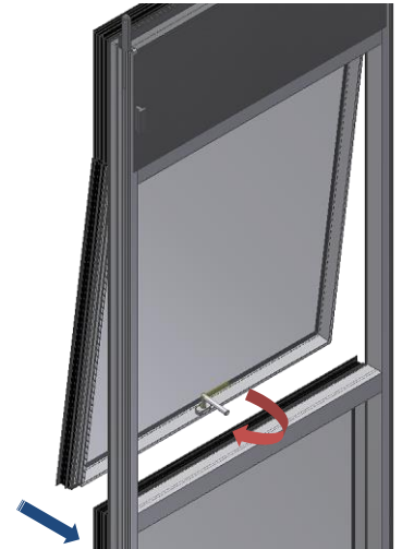
08. Close vent During closing, turn back handle to 90° position