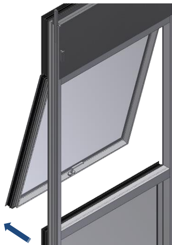
05. Vent can be opened to 15° Handle can be turned back to 90° position No lock in this position If wind then vent may close and stop @ 100mm position and lock again