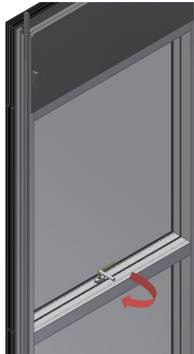
02. Turn handle 90° to unlock