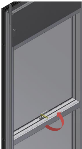
09. Turn handle to lock vent