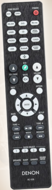
SOUND BAR REMOTE CONTROL