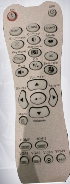
PROJECTOR REMOTE CONTROL