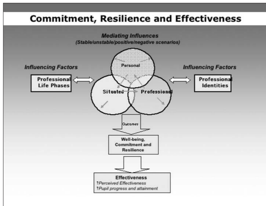
Figure 1: Commitment, resilience and effectiveness

There is a statistically significant association between the levels of pupils' progress and attainment at KS1, 2 and 3 (English and maths) and the extent to which teachers sustain their commitment.