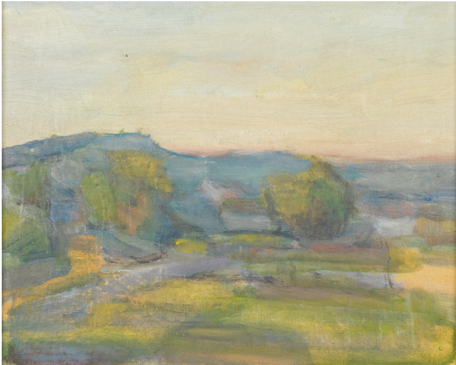
Figure 2.1 Ivan Aguéli, Gotländskt landskap (Gotland landscape) c. 1891. Oil on canvas, 27 x 32 cm. Collection of Sala Konstförening—Aguélimuseet.