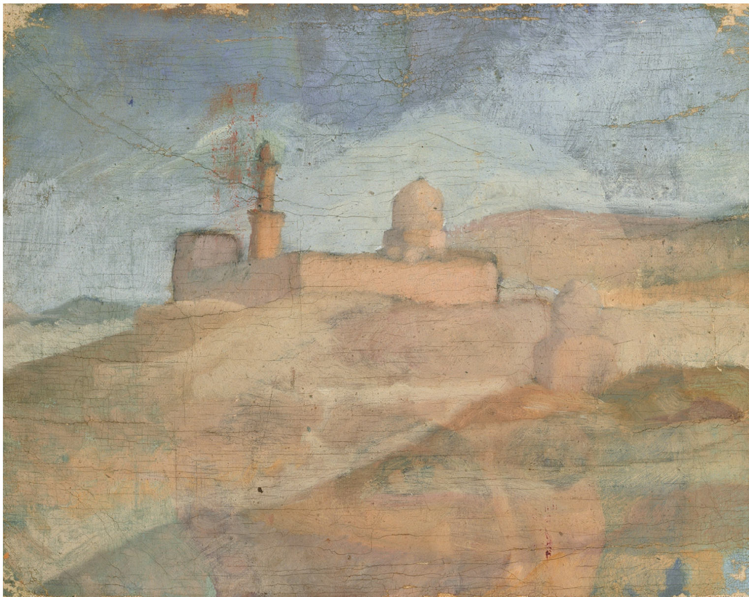
Figure 6.3 Ivan Aguéli, Moské II (Mosque II), 1914–15. Oil on canvas, 23 x 29.5 cm. Prins Eugens Waldemarsudde.