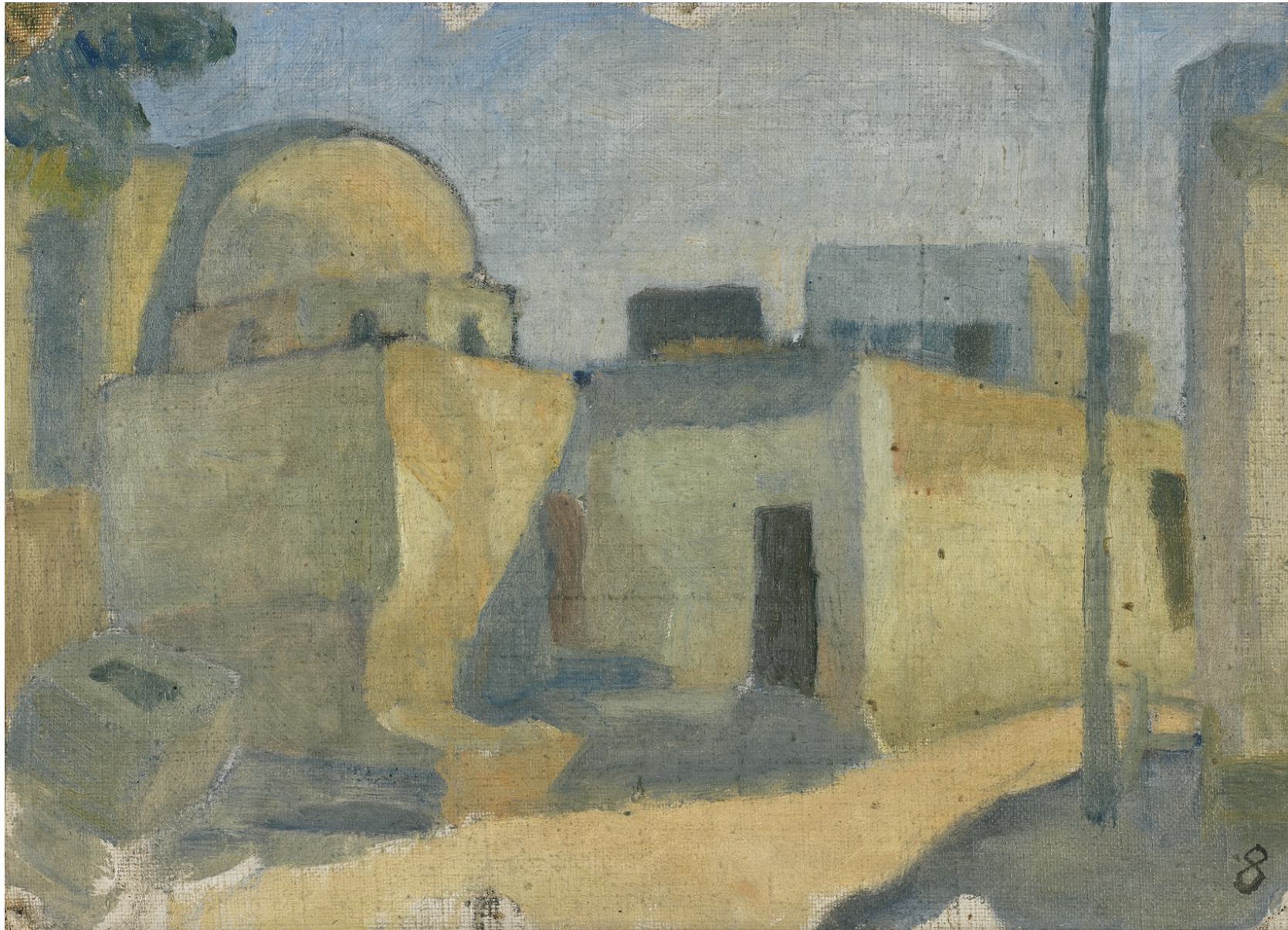
Figure 6.1 Ivan Aguéli, Egyptiskt kupolhus (Egyptian Domed House), c. 1914. Oil on canvas, 21.5 x 30.5 cm.