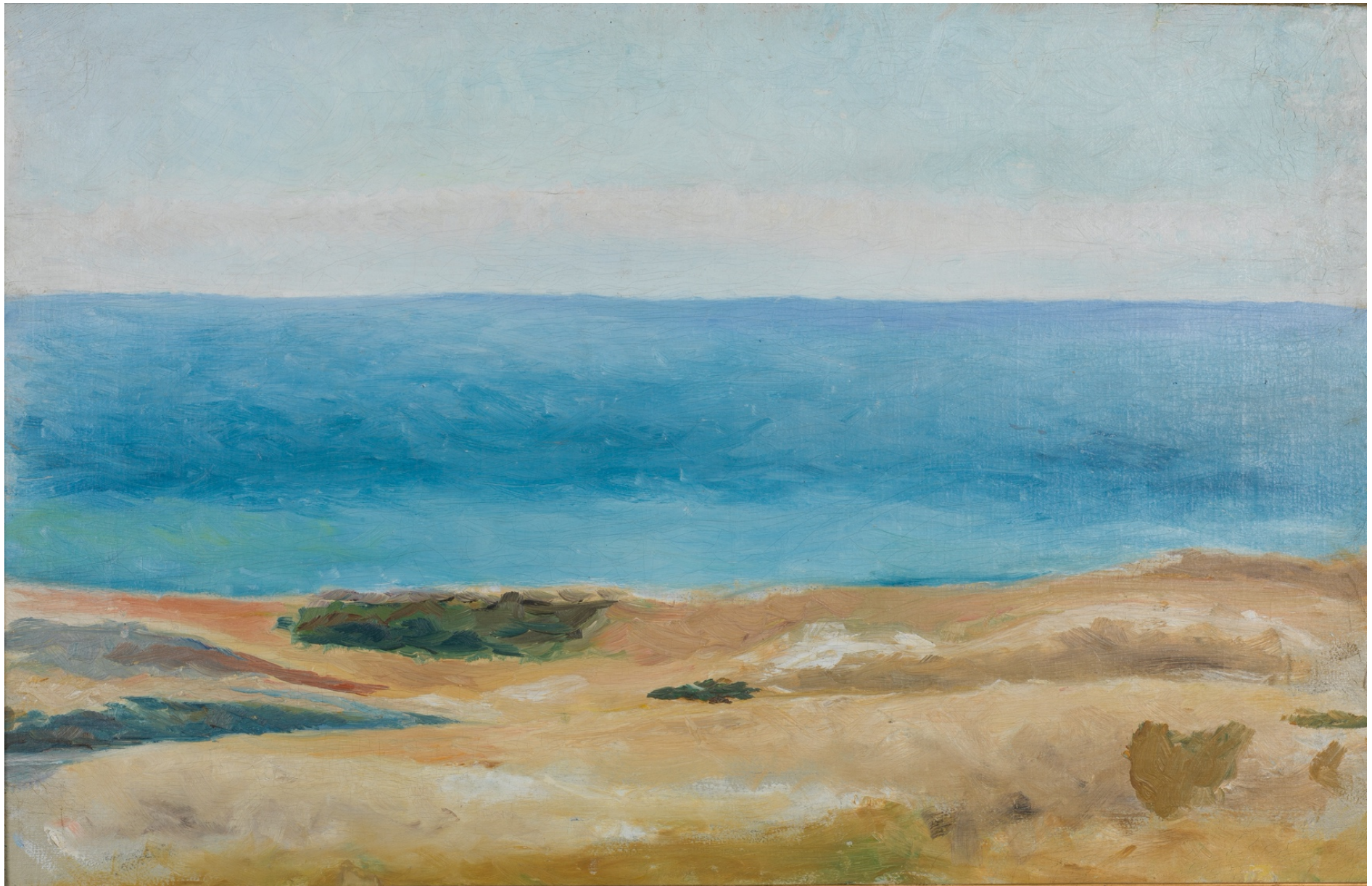
Figure 2.2 Ivan Aguéli, Stockholmsutsikt (View of Stockholm), 1892. Oil on canvas, 46 x 58 cm. Private collection.