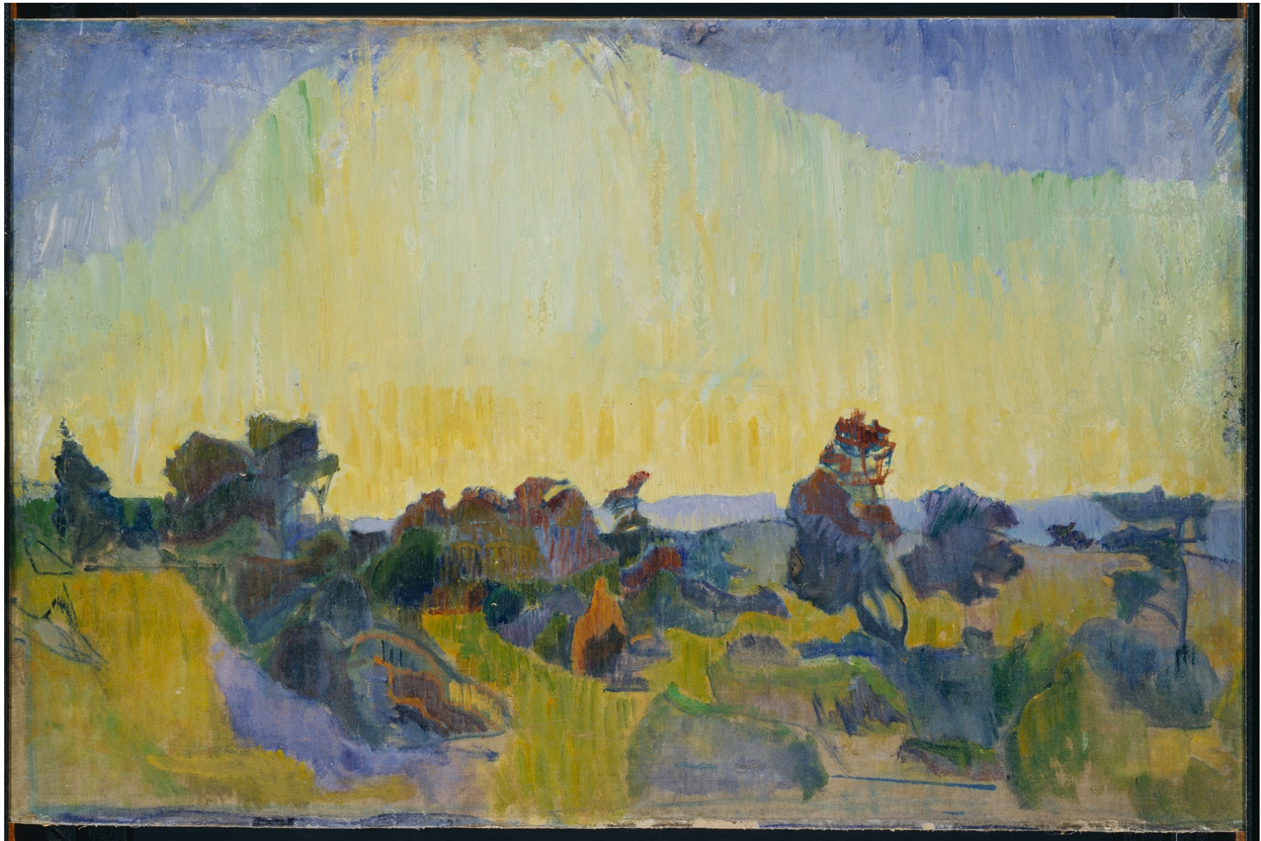
Figure 5.3 Ivan Aguéli, Motiv från Visby II (Motif from Visby II), 1892. Oil on canvas, 51 x 79.5 cm.