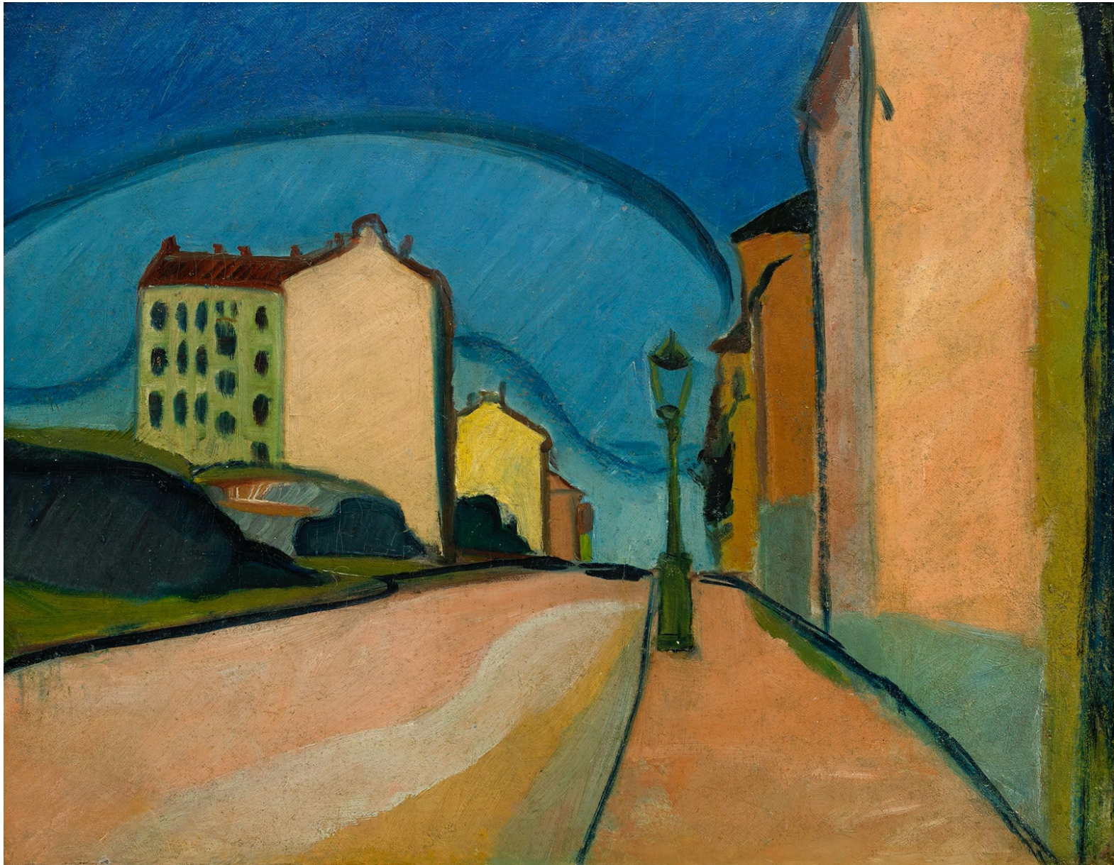
Figure 2.3 Ivan Aguéli, Havsstrand Gotland (Gotland Beach) , 1889. Oil on canvas, 41 x 63.5 cm.