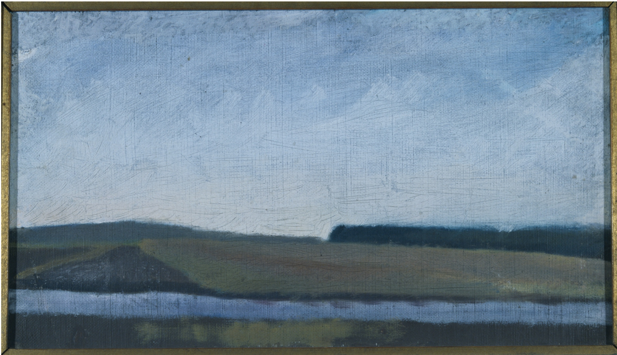
Figure 5.1 Ivan Aguéli, Slätten (The Field), c. 1890. Oil on canvas, 23 x 40 cm.