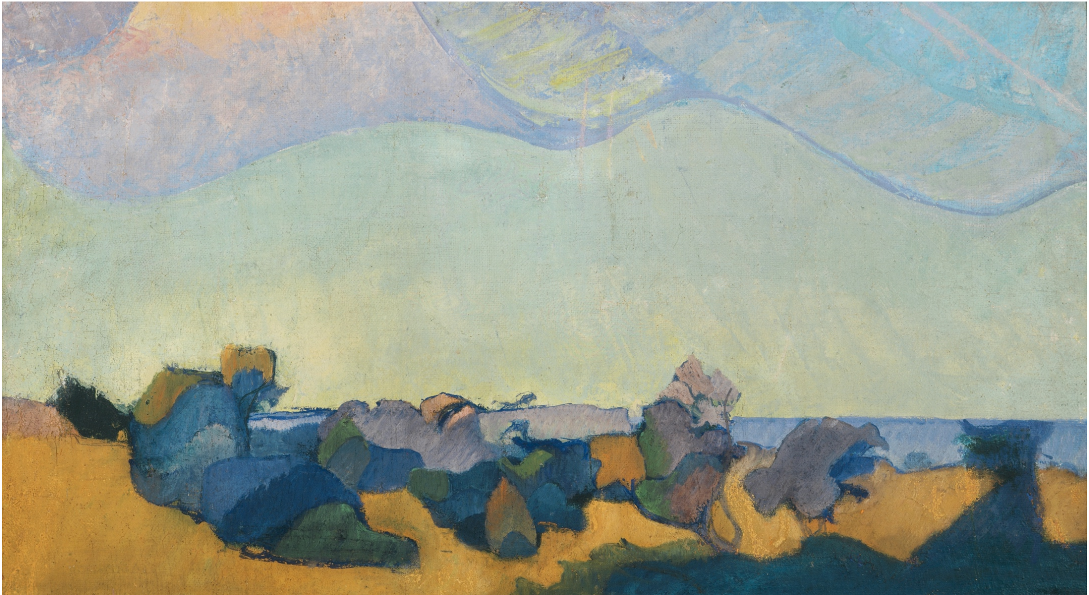
Figure 5.2 Ivan Aguéli, Motiv från Visby I (Motif from Visby I), 1892. Oil on canvas, 50 x 90.5 cm.