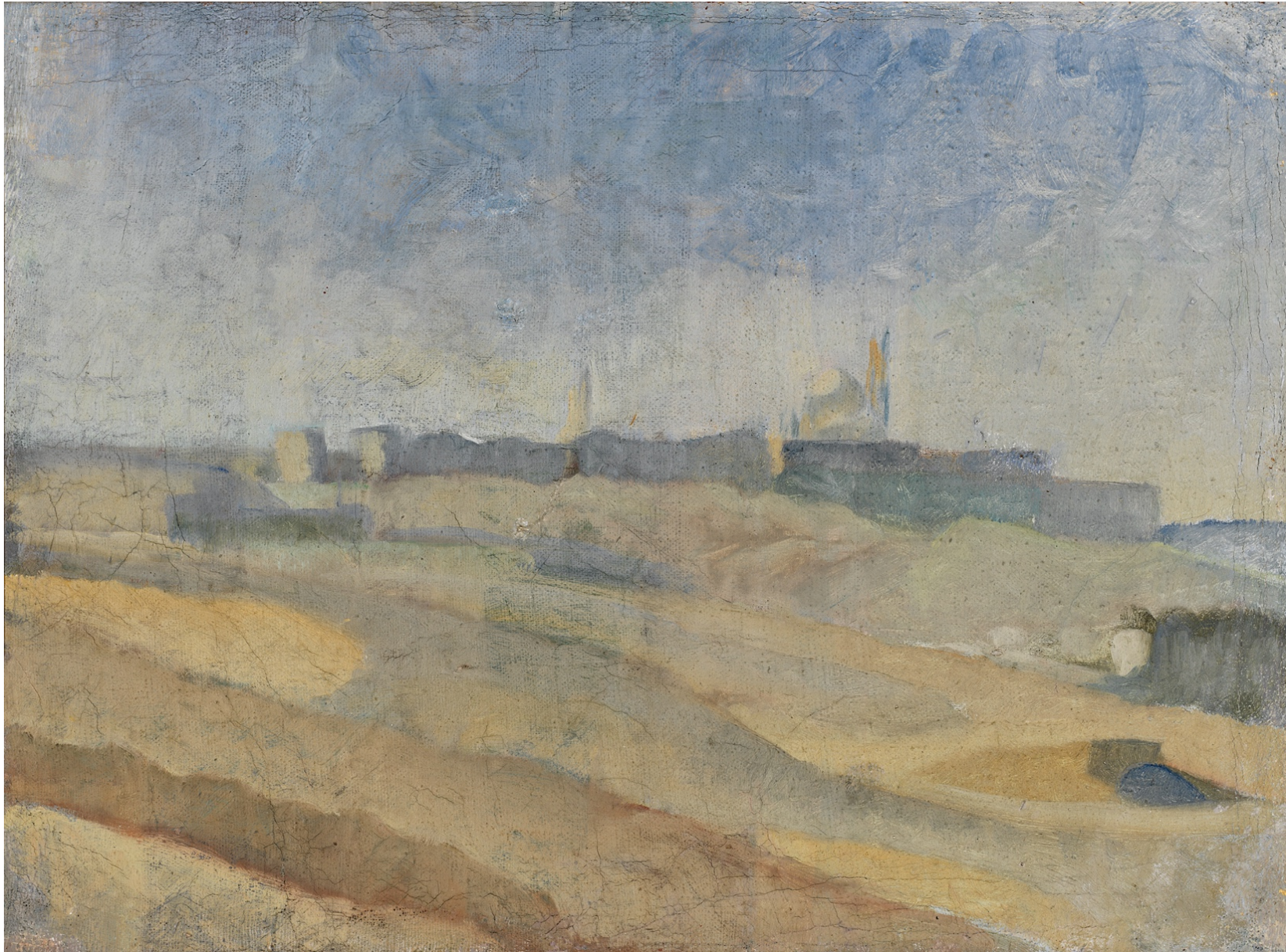
Figure 5.4 Ivan Aguéli, Staden bland kullarna (The City in the Hills), c. 1895. Tempera on canvas, 22.5 x 30.5 cm.