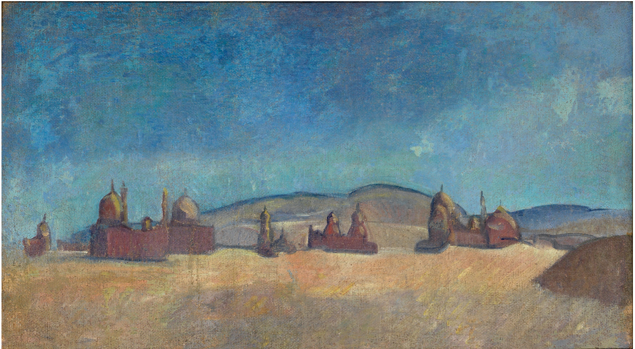
Figure 6.2 Ivan Aguéli, Kalifgravarna (Tombs of the Caliphs), c. 1895. Oil on canvas, 50 x 87 cm.