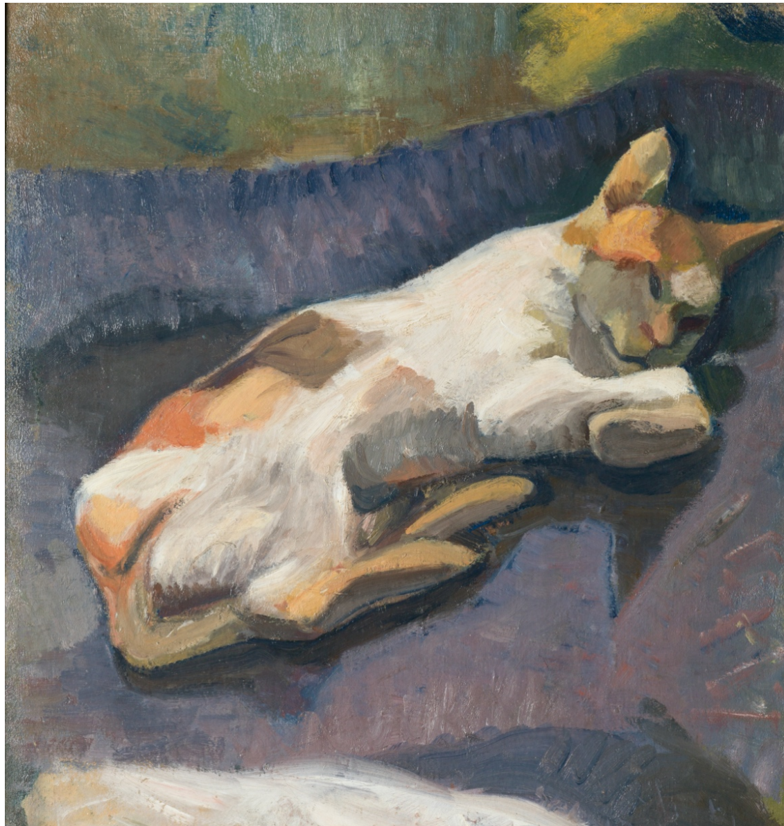
Figure 7.2 Ivan Aguéli, Liggande katt (Reclining Cat), 1890s. Oil on canvas, 40 x 38 cm.