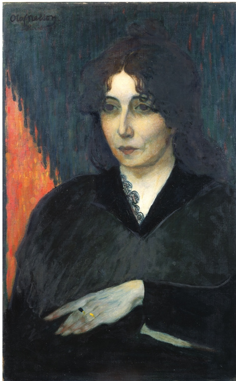
Figure 2.4 Olof Sager-Nelson, La Dame du Silence (The Lady of Silence, i.e., Marie Huot), 1894. Oil on canvas, 62 x 39 cm. Thielska Galleriet, Stockholm.