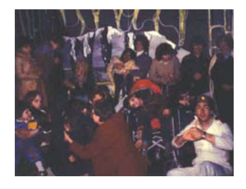
Trip to the Moon (1981)

Mr Horaldo's Human Puppet Show focused on a theft, to be witnessed by the children. They would be asked to take an immediate stance on his actions, before subsequent explorations would explore the thief's motives. The constant dialogue with teachers alongside the company's own process of reflection meant such work did not remain static, but continually responded to the experiences of teachers and to the needs of young people. Planning notes from a subsequent programme, called Trip to the Moon (1981), demonstrate a shift in emphasis, with the priorities for the new programme being: