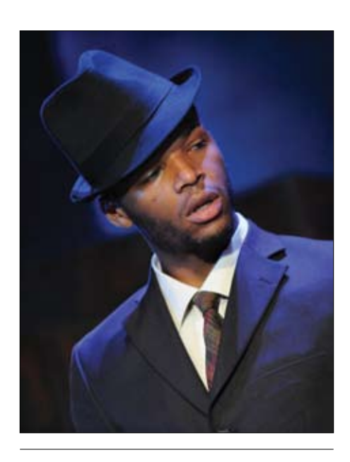
Look Wid Yu Eye (2010)

In addition to this annual TiE programme, the Belgrade also undertakes individual TiE projects. In 2007 the Local Authority's Minority Groups Support Service commissioned the theatre to create a piece exploring the challenges arising as a result of new communities moving into the area, an issue schools had struggled to confront. After conducting interviews with local children, parents, support teachers and youth workers living and