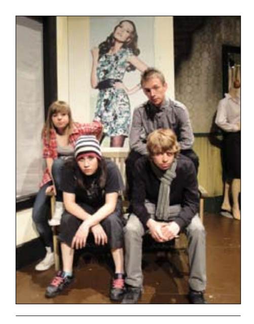
Acting Out in Imperfect (2010)

working in areas that had seen a significant increases in the migrant population, the Belgrade's Community and Education Company devised The First Time I Saw Snow – a piece exploring the intricacies and complexities of this issue. The programme was targeted at specific schools during January and February 2008 and, due to its enormous popularity, was revived for further performances later in the year.