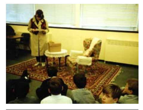
Blood & Honey (1991)