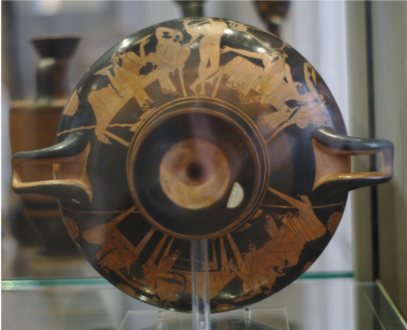
Attic red-figure Kylix, the foundry painter, c.480BC showing scenes from a symposium