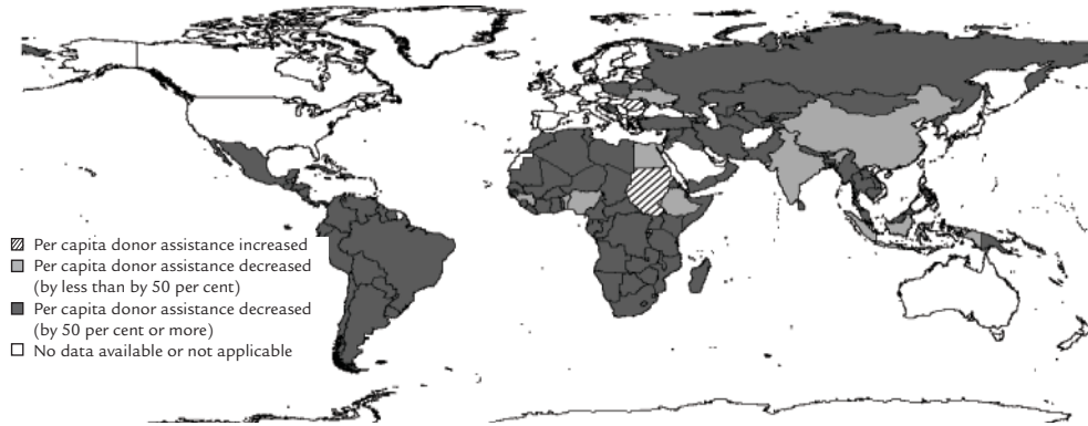
Figure 2.3 Percentage Change in Donor Assistance for Family Planning Programmes per Woman Aged 15-49, 1996 to 2006