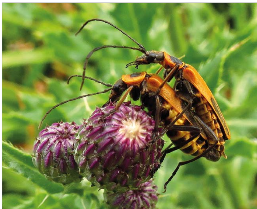
Goldenrod soldier beetles

Perhaps concerted letter writing campaigns are needed. Organize one. Assemble a large and noisy group. Learn how to influence politics on a large scale (an excellent book on this subject is New Conservation Politics [Johns, 2009]). Much needs to be changed at the political level; do you not think it is time to put a huge effort in here? Reverse onus would be a good place to start: instead of society having to prove something unsafe (by an untold number of illnesses and deaths, or environmental catastrophe) the proponent must prove it safe before approval (by a proper process, unlike today's processes). How about the removal of limited liability from corporate