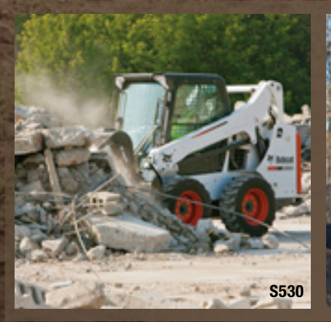
Bobcat gives you more. More models. More options. More versatility.

You can only accomplish one thing at a time with a backhoe. When you combine a Bobcat skid-steer loader with a compact excavator, you can double your productivity. One can dig while the other can backfill or load trucks at the same time.