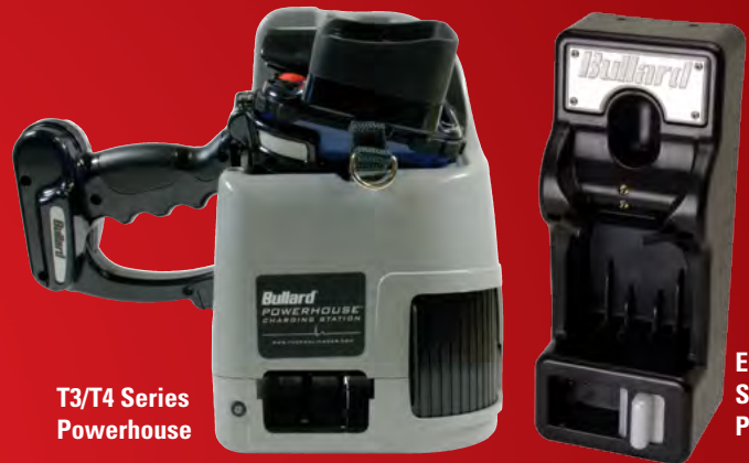
T3/T4 Series Powerhouse

T3 and T4 Series Thermal Imagers can be converted from a highly mobile, handheld device to a longer term, fixed-position surveillance unit. The TacPort attachment provides video-out functionality and auxiliary power ports for extended operation from an external power supply.