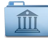
Record locals, Machinery spaces