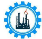
LNG and LPG plants