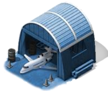
Hangars, ships' holds, cellars

PROSINTEX is designed for protection of: