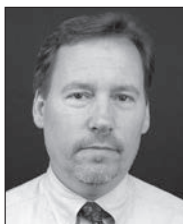
Dr. John M. Hargett SCHOOL OF BUSINESS