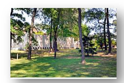
East of De La Salle/Stritch Chapel, south of Lambert and Stritch Halls