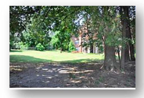
East lawn of Oakdale Capstone Apartments (on Hollywood side)