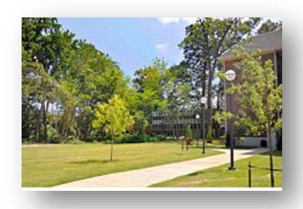
North of the Living Learning Center facing the railroad tracks