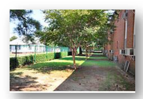
West side of Avery Apartments (facing Oakdale Street)