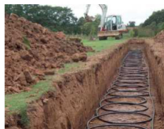
Qual è Il Costo Di Una Pompa Di Calore Nuova Per Gli Anziani Pompe di calore