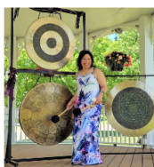
National Gong Day, Summer Solstice Celebrated with Free Energy Healing and Sound Bath Event at Ellcottville Gazebo