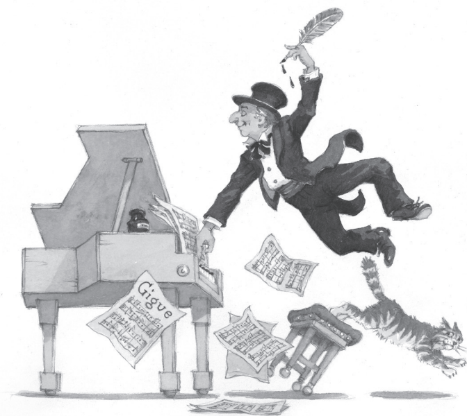
ILLUSTRATION BY ROGER ROTH

Subscribe today to the 2018-2019 season and guarantee the best seats before they sell out!