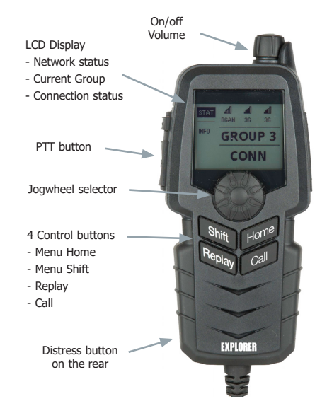
EXPLORER 6205 CSM Handset

For further information please contact: satcom.land@cobhamsatcom.com