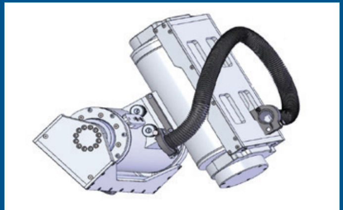
Tactical Tracker Series X over Y motor drive placement

multiple user interfaces to the ICU, which include serial, USB and IP via Ethernet. The user interfaces include both a command line interface and an embedded web server, with a completely redesigned GUI being introduced 2022-Q4.