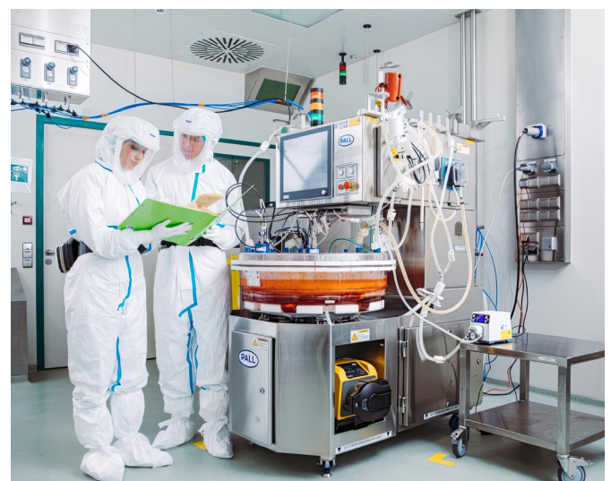
Figure 1: Exemplary image of an iCELLis 500 reactor empowered with Lucullus® at IDT in Dessau-Rosslau.

With Lucullus®, IDT process engineers can nowadays flexibly implement automated process control recipes to allow for quicker project adaptations. The operators can rely on unified monitoring and control interfaces built according to their needs. All data, including contextual information