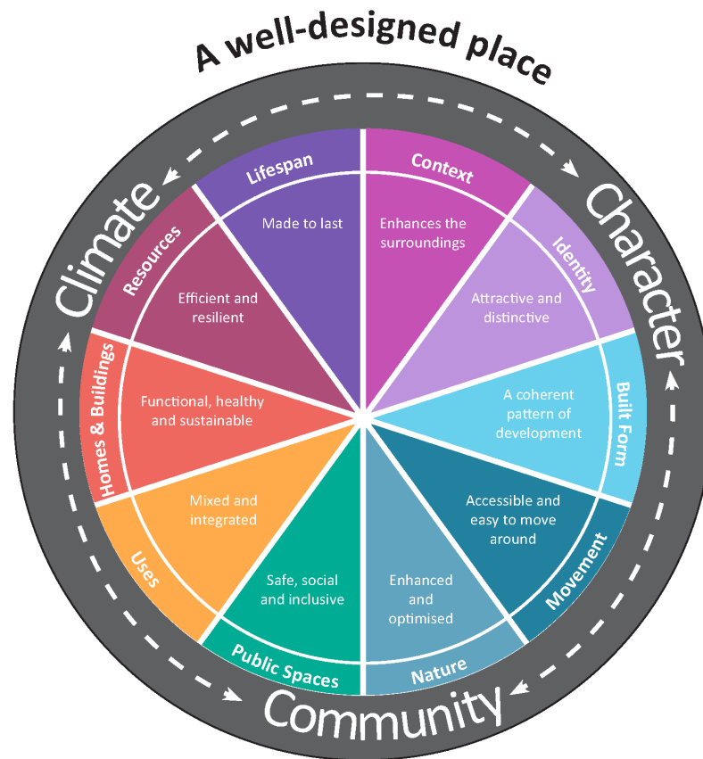
National Model Design Code -The 10 characteristics of well-designed places