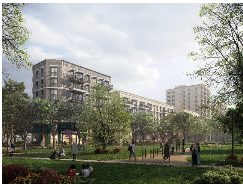
Looking northeast, from Park Road West, towards the planned new homes at Ashley Road Depot