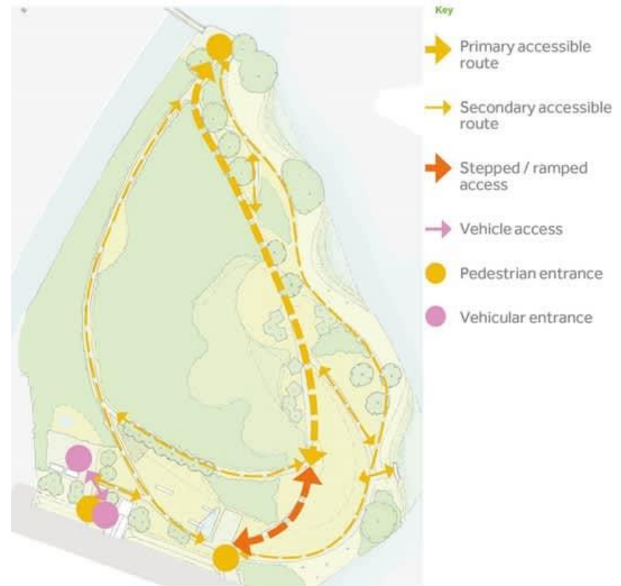
Proposed primary and secondary routes and access points

Respondents who expressed disagreement with the creation/upgrading of the footpath network were concerned about its potential impact on the ecology and peaceful character of the Paddock. There was also some support for retaining existing paths, as respondents considered these to be accessible and would have less ecological impact. Some respondents suggested that a new footbridge connection was needed from the Paddock to the Wetlands, to avoid the need to transit the Paddock. Several comments suggested that the signboards/interpretation proposals were unnecessary and could be a distraction from enjoyment of the space.