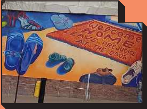
Migration Museum Student Mural at LSC, by the School of Muralism.