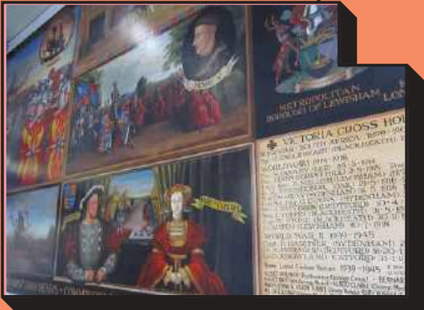
Lewisham History Mural on Molesworth Street, 1998, celebrates key moments and characters of the borough's past, Lewisham Shopping Centre.