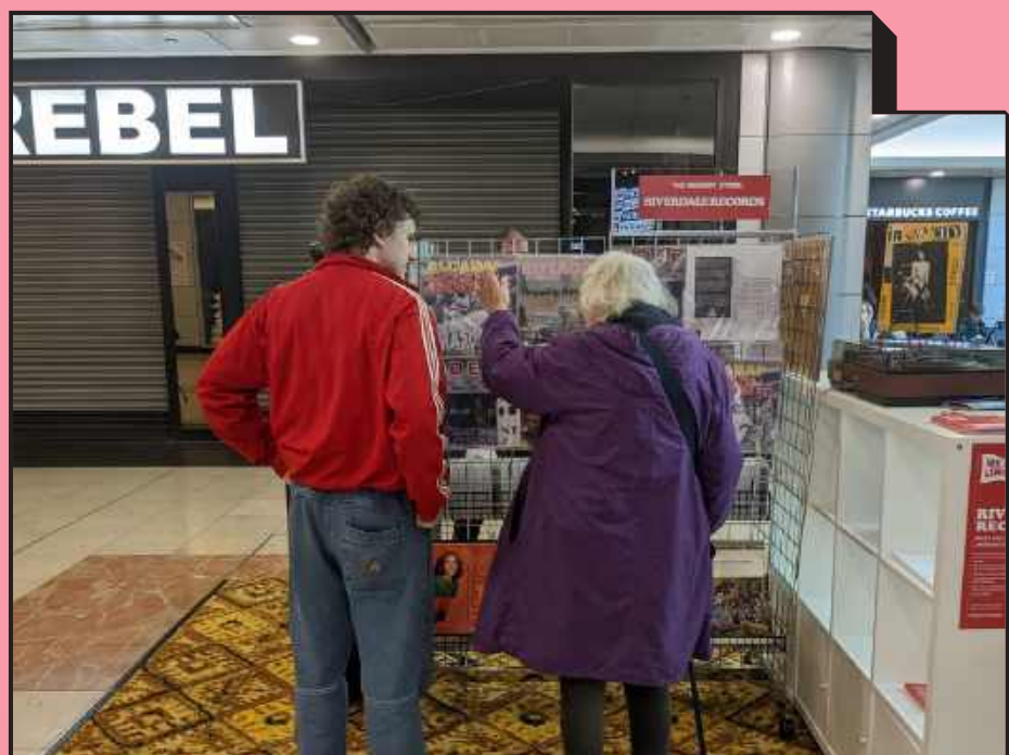
LIVING MEMORY PROJECT TEAM COLLECTING PERSONAL STORIES FROM SHOPPERS

More information can be found at www.sites.gold.ac.uk/inlivingmemory