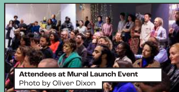
Attendees at Mural Launch Event