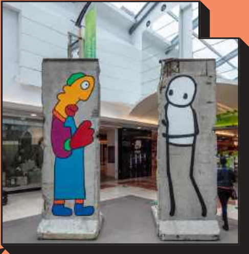
The Wall, features the work of famous muralist, Thierry Noir and Stik, Migration Museum, Lewisham Shopping Centre.