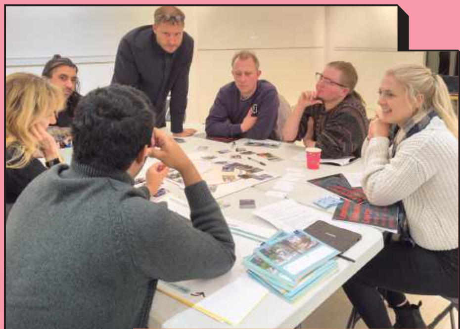
THE DESIGN CHAMPIONS REVIEWING EXAMPLES OF GOOD PUBLIC REALM

In the coming months, we will be sharing more details about how the group has helped shape our thinking and the future proposals, and we will be asking you to feedback on this through public exhibitions, workshops and other engagement activities linked to the masterplan.