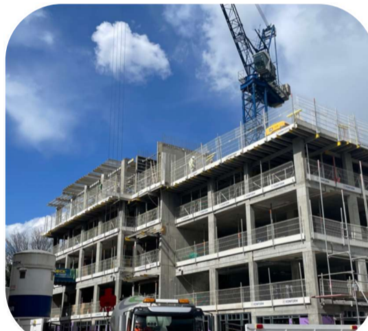
Apartment Block Structural Frame