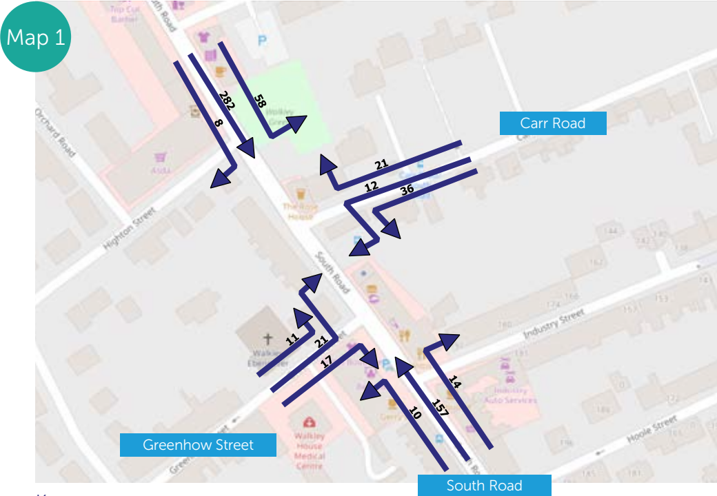
Number of motor vehicles travelling through the South Road / Greenhow Street junction in the mornings after the scheme (May 2023)