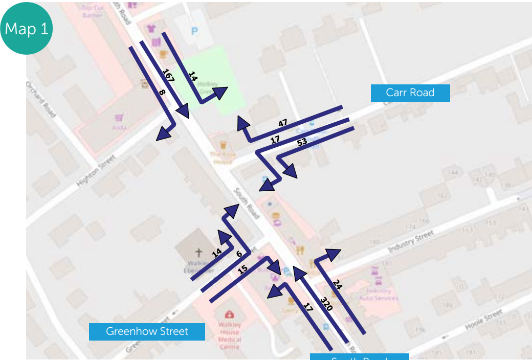
Number of motor vehicles travelling through the South Road / Greenhow Street junction in the evenings after the scheme (May 2023)