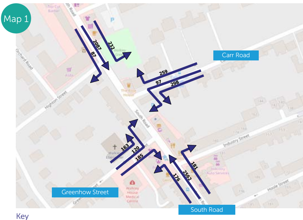
Number of motor vehicles travelling through the the South Road / Greenhow Street junction after the scheme (May 2023)