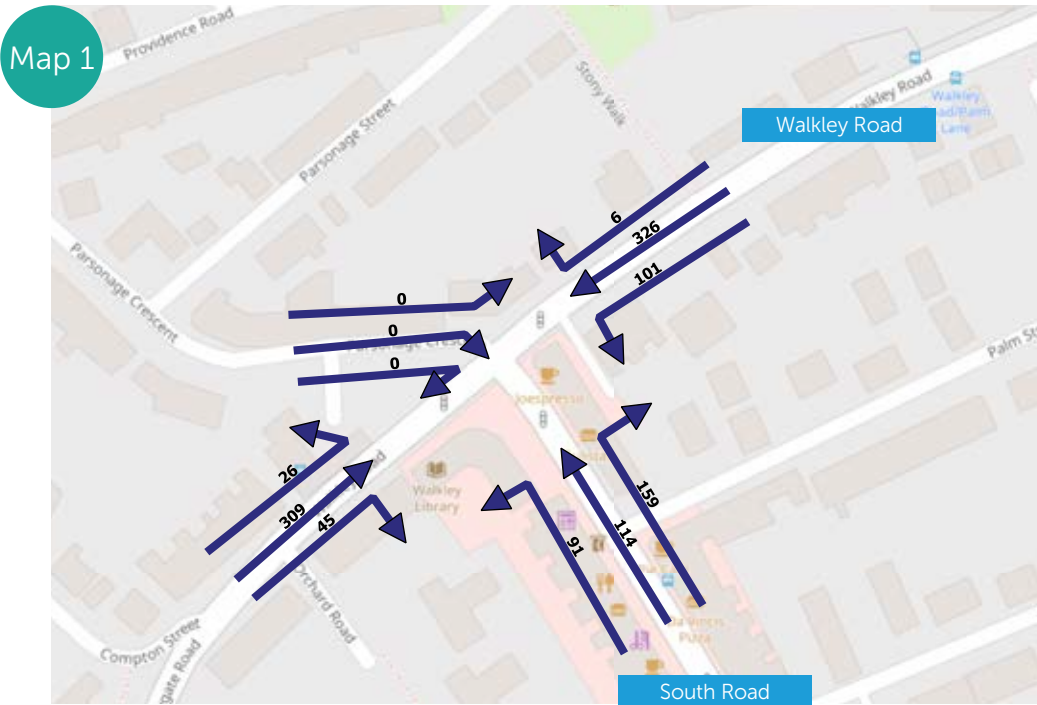
Number of motor vehicles travelling through the Walkley Road / South Road junction in the evening after the scheme (May 2023)