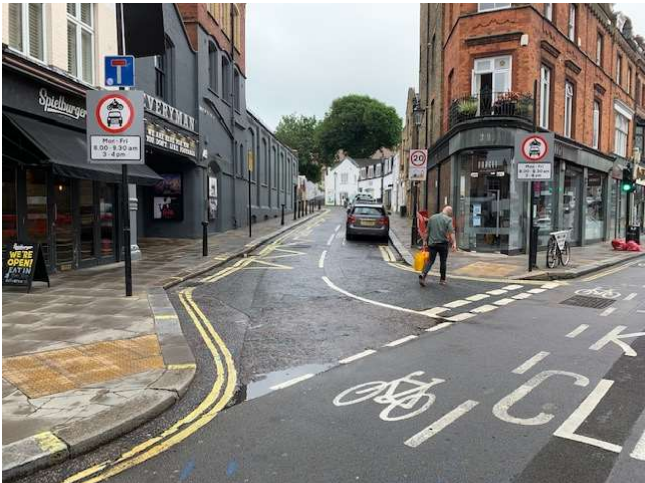
Photo of Holly Bush Vale Healthy School Street taken from Heath Street

The results for all three sites during the morning and afternoon monitoring periods show that traffic speeds are low and the 20mph speed limit is being adhered to.