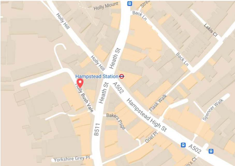
Figure 3 – Location of air quality monitoring diffusion tube on Holly Bush Vale