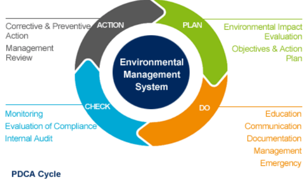
Understand environmental impacts related to business and continuously develop improvement activities

This ongoing process enables the organisation to continually improve its EMS and its overall environmental performance. It should be emphasised that the EMS does not produce results automatically. It will do so only if the corresponding objectives are defined and programmes implemented. adidas strongly supports a results-driven and improvement-focussed approach. The system is only valuable if substantial environmental improvements are achieved with the help of the system. The system is the vehicle to achieve these results.