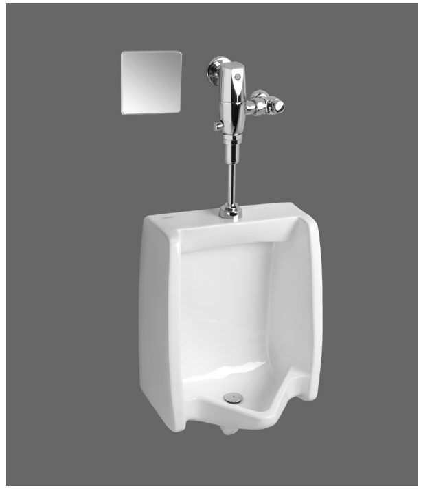
SEE REVERSE FOR ROUGHING-IN DIMENSIONS