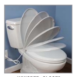
WHISPER • CLOSE®