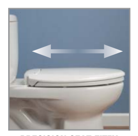
PRECISION SEAT FIT™ 1" ADJUSTABLE HINGES