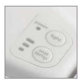
MULTI-SETTING WARMING SEAT

Fastening System: STA-TITE® Seat Fastening System™