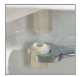
STA-TITE® SEAT FASTENING SYSTEM™