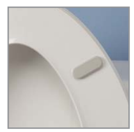
SUPER GRIP BUMPERS™