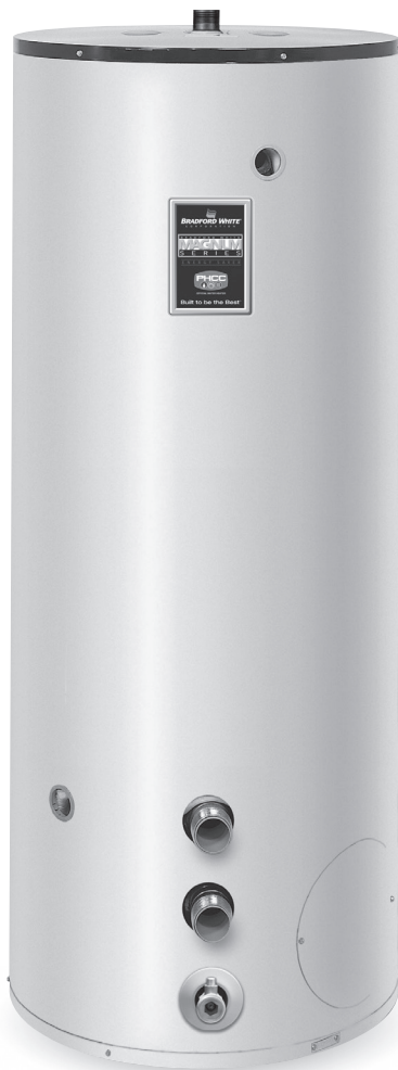
Photo is of M-3-ST80R5