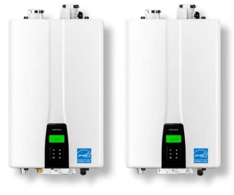
NPE-A2 Advanced condensing tankless water heaters